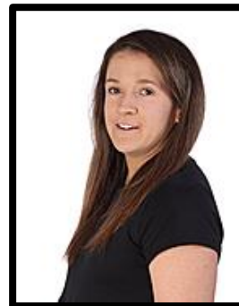
Miss Barrow Blue Class Teaching Assistant 1:1 support