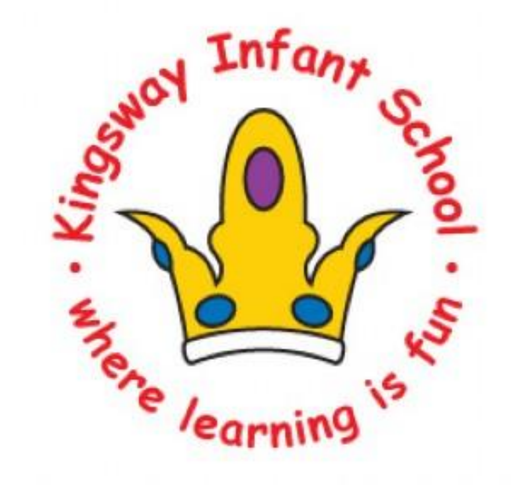
Year 2 Meet the Teachers