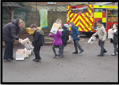
The children lined up the Tudor houses they had made, close together just like a London street in 1666.

Year 2 had an exciting finish to their Great Fire of London topic this week – the re-enactment of The Great Fire of London. Thank you to Blue Watch at Garston Fire Station for making the afternoon extra special.