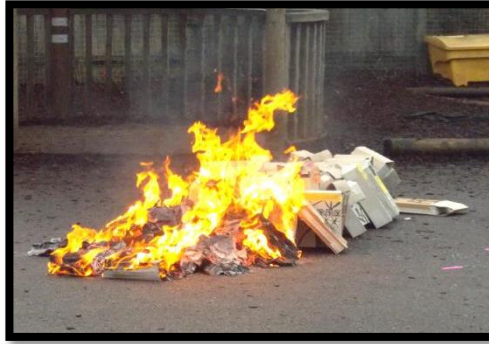
The houses were then set alight under the supervision of the firemen and the children watched as the flames grew larger as they were fanned by the wind